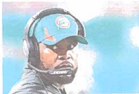
Miami Dolphins head coach Brian Flores during the second half of an NFL football game against the New England Patriots, Sunday, Jan. 9, 2022, in Miami Gardens, Fla.

veteran receiver and special teams ace, told The Associated Press. "I don't know if it's the process," he added. "I don't know what you want to attribute it to. But you look at the end result for our league to be composed of 60% African-Americans and only have one African-American coach, one minority owner, not a lot of representation within front office and upper man-